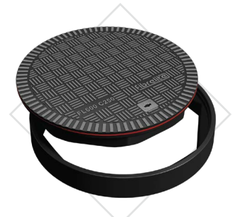
VPFL 100 Round Fibrelite Cover

Completely secure H-20 traffic rated fiberglass manhole cover and frame, structurally, the fiberglass cover and frame exceeds AASHTO H-20 standards and meets EN 124 Class D400 requirements and can be used on both pre-cast concrete and fiberglass manholes. Unlike the heavy cast iron covers of the past, this manhole cover is lightweight and easy to handle. It offers little interference with radio frequency signals and holds no scrap value. Perfect for the most corrosive settings such as sewer, water, and wastewater among others. Available in numerous sizes!