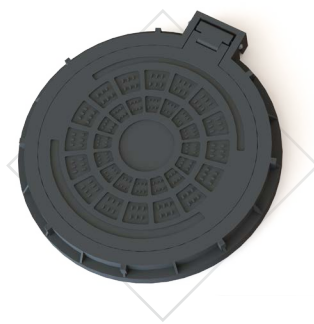
VPC 3000 Hinged Lockable Cover